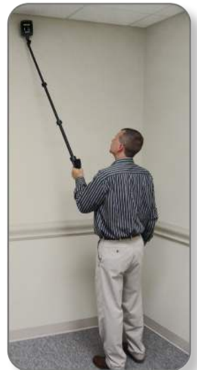
Telescoping antenna pole extended.