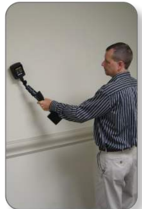
Telescoping antenna pole retracted.

Batteries: Lithium Ion Rechargeable Battery (2 included)