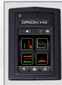
Main screen offers quick mode selection.

MODEL INFORMATION: The transmit power of the ORION 900 HX is 1.4 W EIRP and automatically searches for quiet operating frequencies between 840 and 960 MHz. It is FCC and IC compliant. The G model , with 3.2 W EIRP transmit power, is available to entities, agencies, and persons not restricted by FCC and IC. Both models are CE marked for public safety and security. Commercial CE version also available.