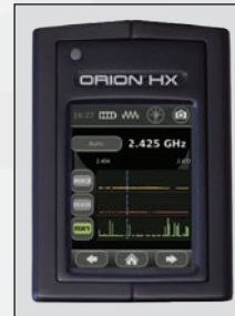
Frequency adjust screen displays Transmit, 2nd, and 3rd frequency ranges.