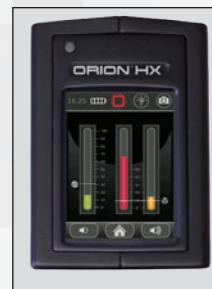
Tx and Rx graph displays power, 2nd, and 3rd harmonic levels and touch screen trip and power level adjustments.