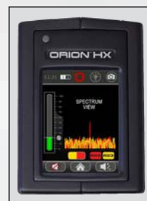
Spectrum View shows 2nd and 3rd harmonic spectrum graphs in several view options