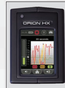
Histogram graph displays history of harmonic response and power adjustment from 10 - 60 second duration.